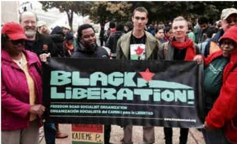
FRSO/OSCL banner at Ferguson